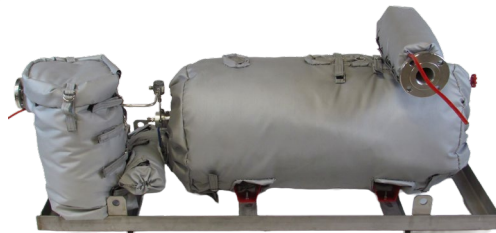
J-7000 SM-P DP-1 CW Adder