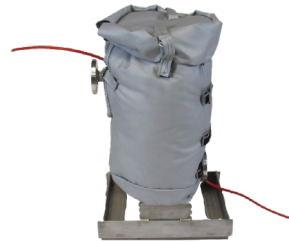
DP-1 - CW Adder