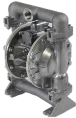
DP-1 - 1" Diaphragm Pump