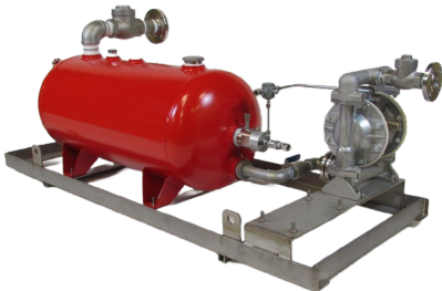
J-7000 w/1" Diaphragm Pump Skid